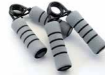
Hand Grips Various strengths available