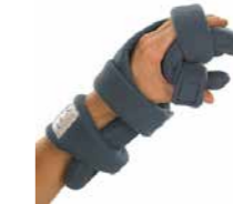
Rolyan Hand Splints Various sizes available