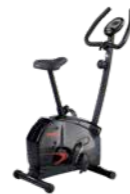
Resistance Level Exercise Bike FPF290610