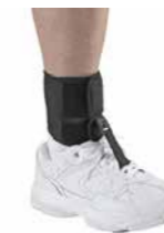
Ankle Foot Orthosis Various sizes available