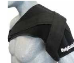
Body Assist - Sports Thermal Various sizes available