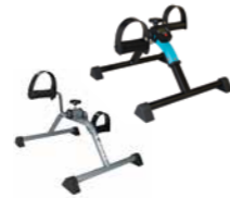
Aspire Exy Pedal FPP292800 - Manual FPP292810 - Digital