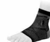
Elastic Ankle Strap Various sizes available