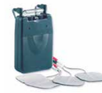
TENS Unit - Digital with Electrodes & Leads FPP315210