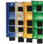
Soft Ankle/Wrist Weights Various weights available